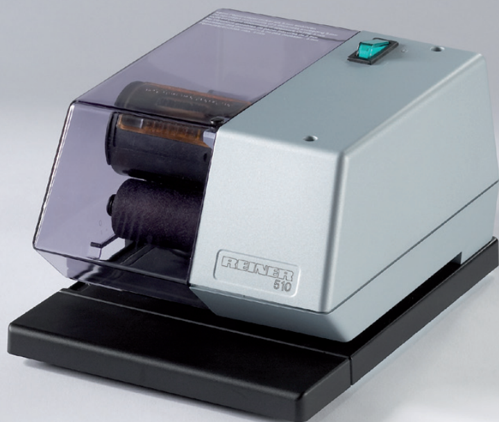
Sample Print: Original