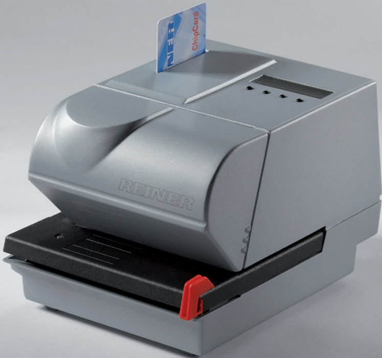
Sample Prints: Original