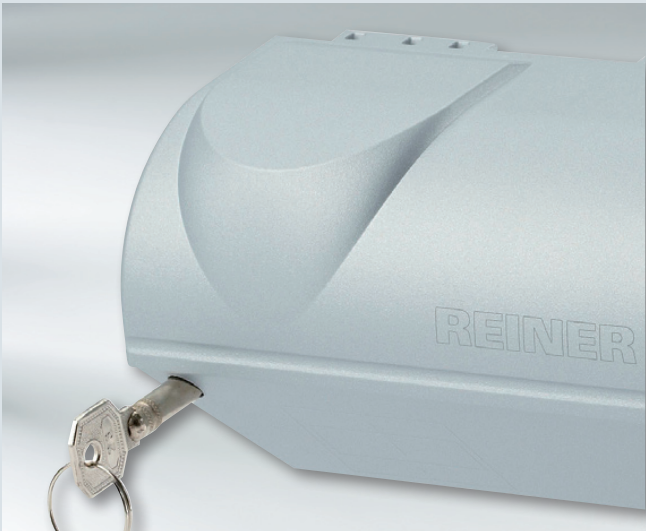
Security head access lock, prevents manipulation of textplate.